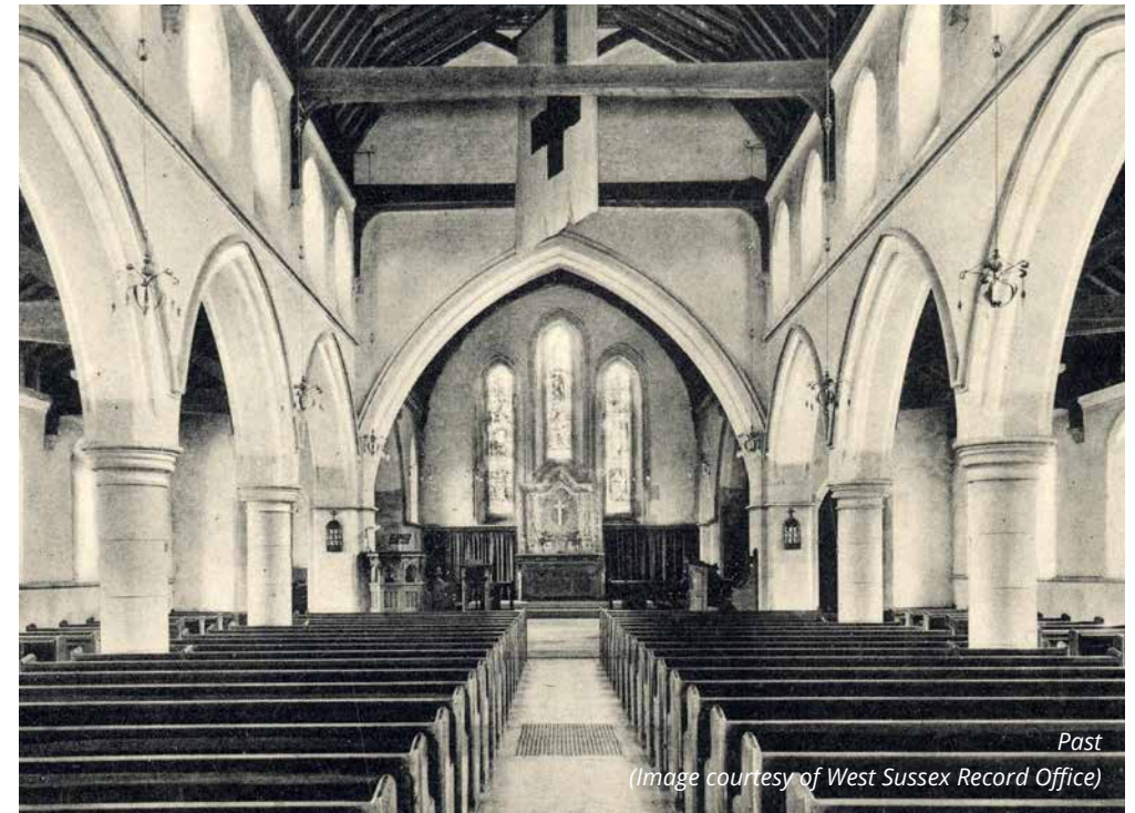
Past

In addition to his religious duties, the chaplain was also involved with assisting illiterate patients with correspondence, organising and supplying the hospital library and holding regular religious instruction classes. Attendance throughout this period seems to be around 70% which was regarded as very satisfactory and there can be no doubt that the chapel played a vibrant and rich role in the daily life of Graylingwell.